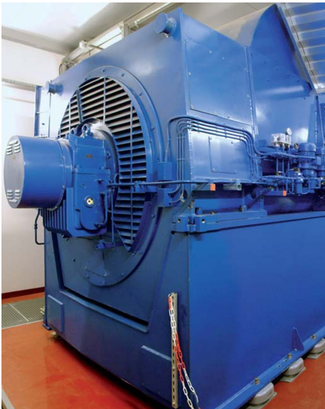
Gas engine of a combined heat and power plant for AMD Dresden

A conventional cogeneration plant module has an electrical output between five kW and five MW. Combustion engines - preferably natural gas engines but also sewer gas and biogas engines, biodiesel engines and gas turbines - can be used to drive the power generator. The natural gas cogeneration plant for semiconductor production at Advanced Micro Devices, Inc. (AMD) constructed in 2004 in Dresden, with an output of 35 MW of electricity, 38 MW of heat and 53 MW of refrigeration, constitutes a prime example.