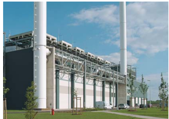
Energy Center EVC 2 in Dresden