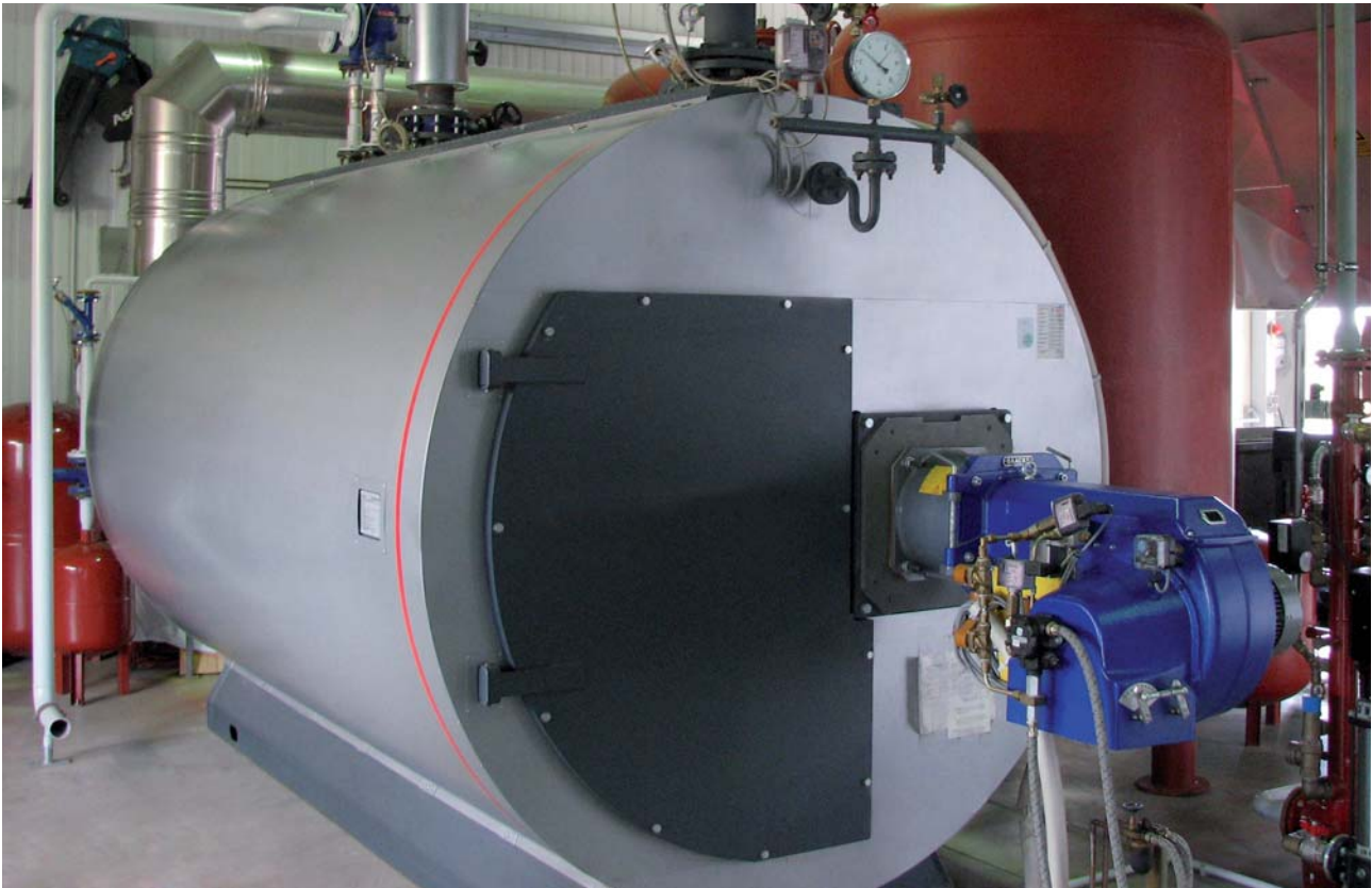
Conventional hot water system fired by natural gas

Boilers are the standard heat generation solution in power generation plants. They are heat generators with combustion chambers for solid, liquid or gaseous fuels which provide heat energy used for heating rooms, producing hot water or for use in production engineering. The combustion heat generated when fuel burns is released to heat carriers (water, water vapour, thermal oil) and carried to heat consumers (radiators, heat exchangers). Different boiler designs are available for various output ratings and areas of application.