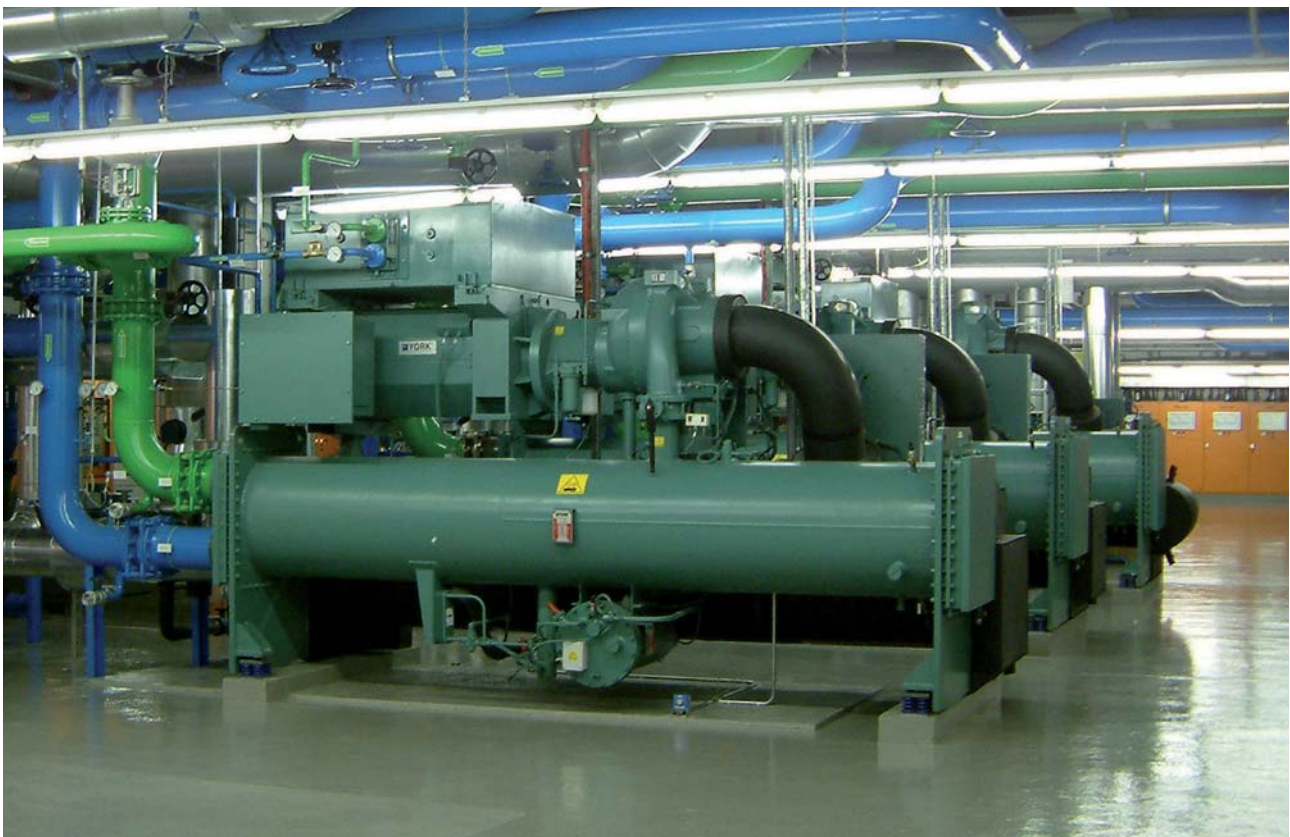
Compression-type chiller IBM Ehningen

Compression cooling plants use the Carnot process; they are fitted with a mechanical compressor and a refrigerant metering device (thermostatic expansion device). A compression and expansion element as well as two heat exchangers (evaporator and condenser) are required. The heat exchangers are interconnected in a circuit in such a way that they are placed on both sides between the compression and expansion element. Currently, only CFC-free coolants and ammonia are permitted as working fluids. Developments using propane, butane, air and water are underway. This technology is widely used in domestic refrigerators, freezers, top-loading freezers, dispensing equipment, cold storage, air conditioners, industrial cooling units and heat pumps. The technologies that are used include split systems discussed above, piston and screw-type water coolers and turbo water coolers. Based on these extremely widespread technologies, AGO AG Energie + Anlagen has installed a large number of such systems in recent decades.