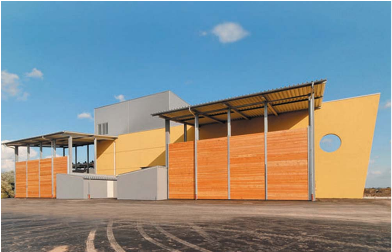
Biomass cogeneration plant in Alperstedt

In the heating plant engineering field, AGO offers power generation plants suitable for steam preparation or the generation of warm and hot water in all performance categories. AGO products allow plants to be designed for use with various energy sources. However, the main focus of the Company is on plants that use biomass (e.g. wood chips). The AGO AG Energie + Anlagen product range also includes heating plants operated using conventional energy sources (oil or gas). The choice of energy sources is based on availability, customer requirements, and annual heating capacity utilization.